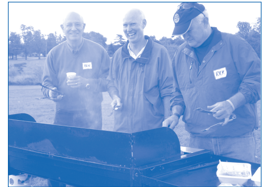
Club Family Picnic