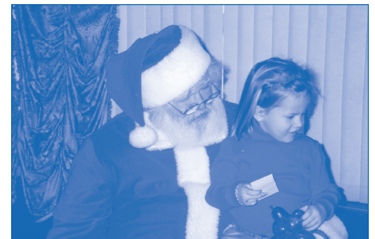
Children's Holiday Party