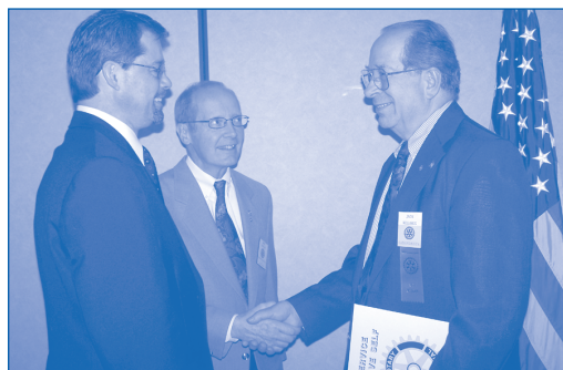
New Member Induction Ceremony