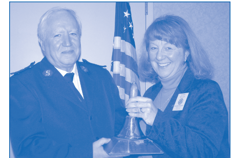
Salvation Army Bell Ringing Contest