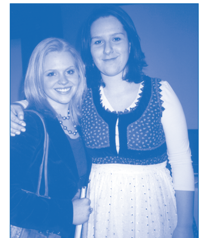
Outbound & Inbound Exchange Students